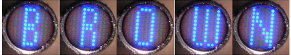
Emission patterns generated at the end of a multicore image fibre 600 \mu\text{m} in diameter, from article 094013 by H Xu et al from Brown University.

with single-photon detection arrays which facilitate integrated optical lab-on-chip devices in conjunction with the micro-LEDs. Belton et al , from within the project partnership, overview the hybrid inorganic/organic semiconductor structures achieved by combining gallium nitride optoelectronics with organic semiconductor materials. The contributed papers cover many other aspects related to the devices themselves, their integration with polymers and CMOS, and also cover several associated developments such as UV-emitting nitride materials, new polymers, and the broader use of LEDs in microscopy.